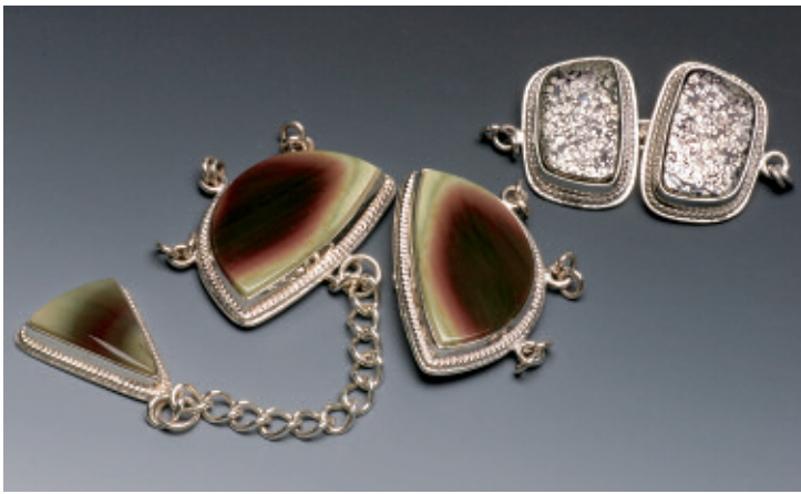
MATCHED CLASPS of Imperial Jasper pair (2.7 centimeters high each) having a chain extender. These well-made findings are from Asian manufacturers.