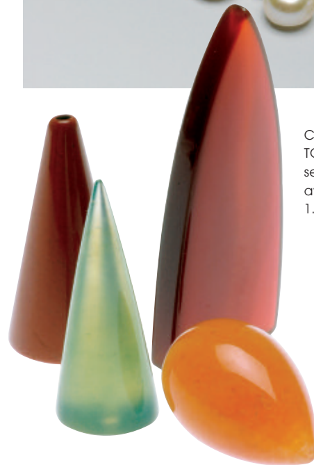
CONES, DROP AND POINTED TONGUE SHAPES of green serpentine, red jasper, red aventurine and carnelian, 1.6-3.5 centimeters.